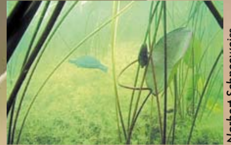
European Pond Turtle swimming in pond