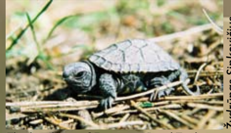
The hatchling of European Pond Turtle