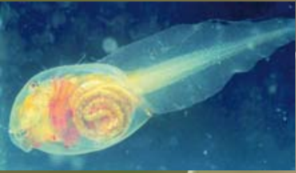
The larvae of Fire Bellied-Toad