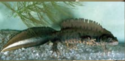
Colored male of The Great Crested Newt in breeding season