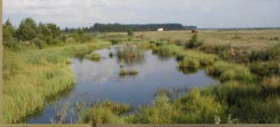
Shallow waters represent good habitats for Great Crested Newts and Fire Bellied-Toad