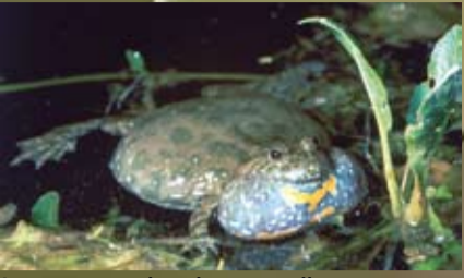
In spring toad males are calling pretty melody like "oop oop..."