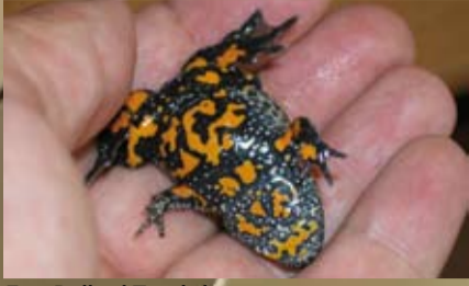
Fire Bellied-Toad dresses smart warning colors