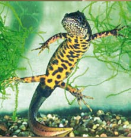
Yellow or orange belly of The Great Crested Newt with black spots fascinates the sight